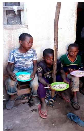
food during circus training